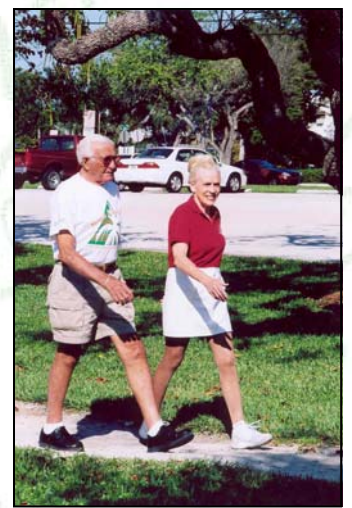
Walkers enjoying the beautiful day at one of the Kick-Off events for Walk Fort Lauderdale March 2007!

Walk Fort Lauderdale kick-off events were held the week of March 5th at four City of Fort Lauderdale neighborhood parks including Joseph C. Carter Park, Holiday Park, Osswald Park and George English Park. Over 150 participants completed a Walk Pledge stating their desire to increase and track their physical activity. A free pedometer and walking log was given to each adult to track their progress for the next two months. Each participant was also given a walking guide and map illustrating the City's walking and jogging paths as well as fitness stations. After a brief stretch, guided walks were taken around the beautiful city parks strolling amongst lakes, mature trees, fields and new friends.