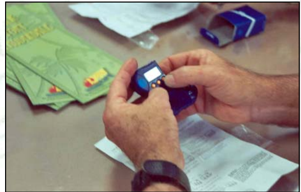
Free pedometer given to participants who sign pledge card.

Your pedometer counts walking steps according to the movement of your waist. It can be used to show you how many steps you have taken, how far you have walked and how many calories you have burnt. It also includes a stopwatch. In order to count correctly, please wear your pedometer vertically approximately 6 inches from the central line of your waist. For maximum accuracy this pedometer can be calibrated to your own personal weight and stride length.