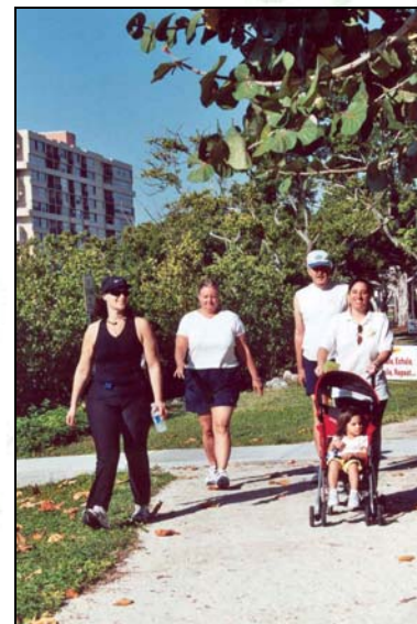
Enjoying the George English Walking Path during the March 10 kick-off event