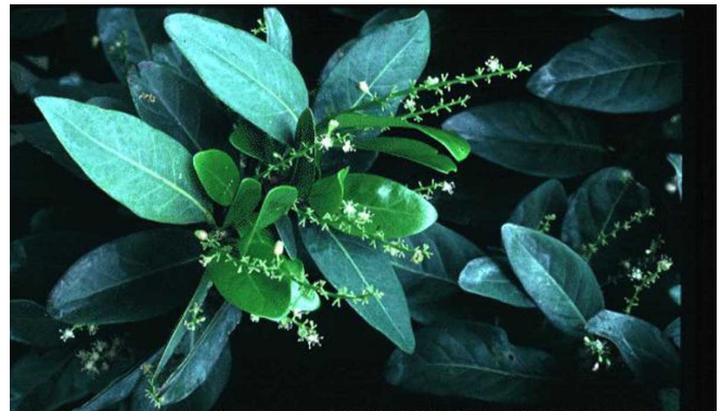
2. Pigeon plum ( Coccoloba diversifolia ), a hardwood hammock-dwelling relative of the sea grape, makes a fine, slow-growing urban tree.