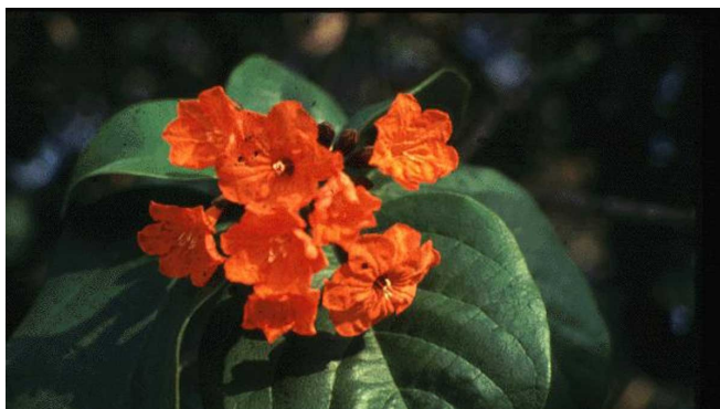
3. The geiger tree ( Cordia sebestena ) has spectacular orange flowers and a high salt tolerance.