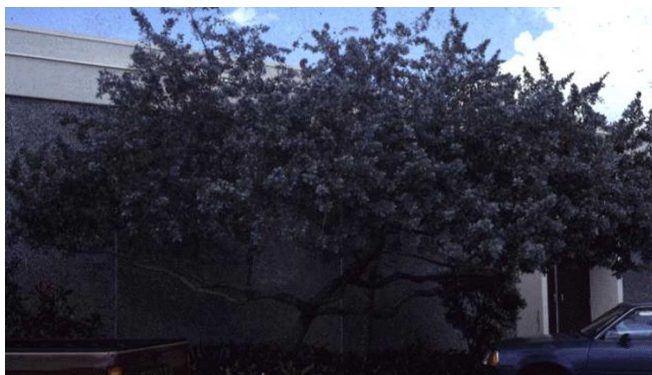
4. The silver buttonwood ( Conocarpus erectus var. sericeus ) is a very salt- and drought-tolerant species.

Under the category of Hardiness Zone, subtropical refers to the transitional area between central and tropical Florida where an occasional winter frost will occur. Tropical refers to southernmost mainland Florida and the Keys where winter frosts are rare to nonexistent. To illustrate, silver buttonwood is categorized in Table 1 as a subtropical/tropical tree with a high tolerance for salt and drought. Before installing a large-scale landscape using native trees listed as tropical only, it is best to confer with your county cooperative Extension service agent about minimum winter temperatures expected in your area. If a particular species can be used in central and north Florida as well, this has been indicated (Table 1).