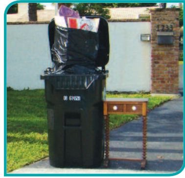
UNACCEPTABLE SET OUT

The City of Fort Lauderdale provides residential garbage collection service twice per week to dispose of household trash generated from your property.