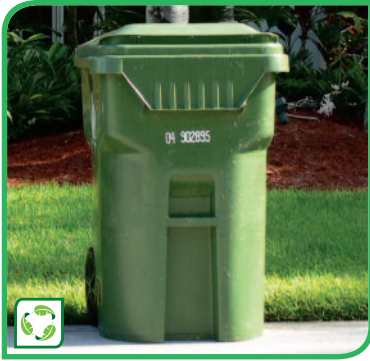
ACCEPTABLE SET OUT

The City of Fort Lauderdale provides residential collection of yard waste materials generated from your property. Items that are too large for your yard waste cart should be recycled by using the monthly Bulk Trash Program.