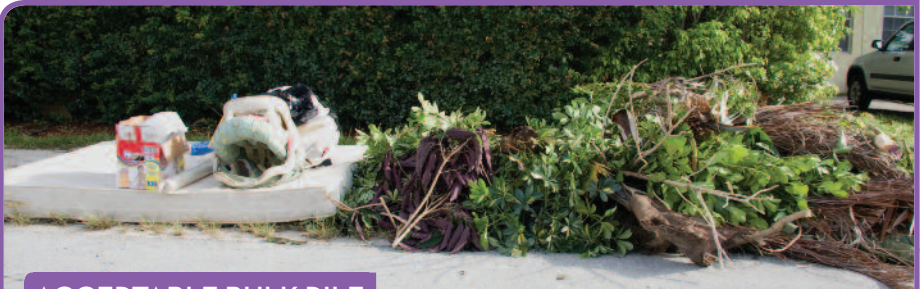
ACCEPTABLE BULK PILE

The City of Fort Lauderdale provides monthly residential bulk trash service to dispose of household items generated from your property, such as furniture, appliances, tree cuttings, and small amounts of construction material.