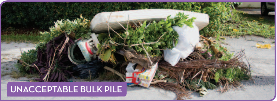
UNACCEPTABLE BULK PILE

Crews will pick up a maximum of 10 cubic yards, which is a pile of trash approximately 6 feet wide, 15 feet long, and 3 feet high, or 6 feet wide, 9 feet long, and 5 feet high.