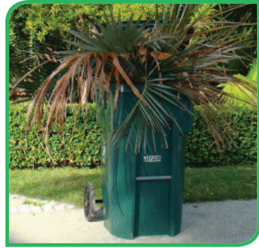
UNACCEPTABLE SET OUT