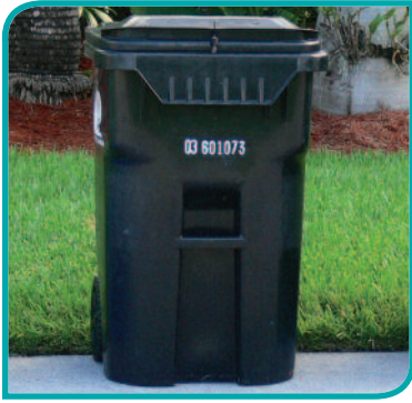
ACCEPTABLE SET OUT