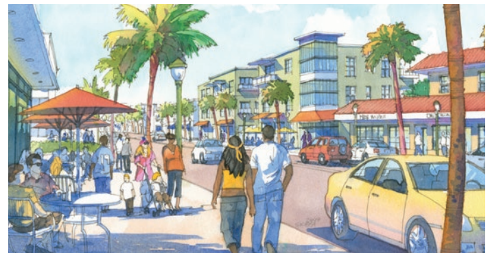
Sistrunk Boulevard Urban Design Improvement Plan Rendering