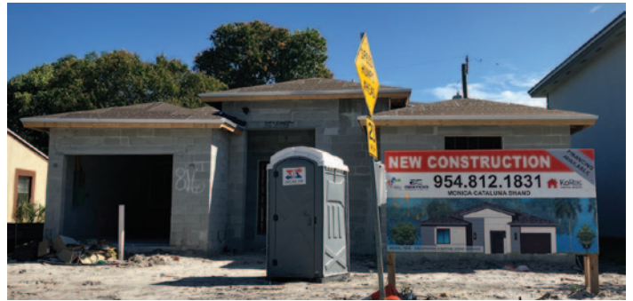
Construction of scattered site infill housing