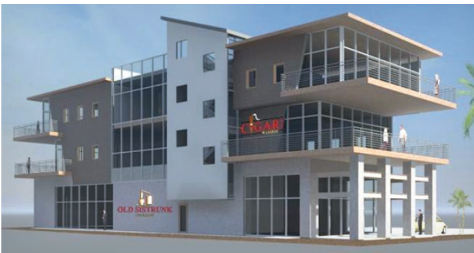
Rendering of the Victory Entertainment Complex located at 1017 Sistrunk Boulevard and 606 NW 10 Terrace