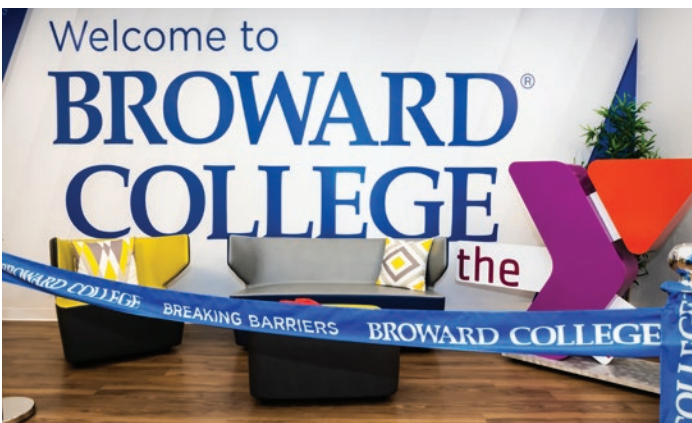
Opening of Broward College at the L.A. Lee YMCA/ Mizell Community Center