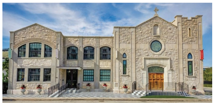
Completion of Holly Blue Restaurant and The Angeles