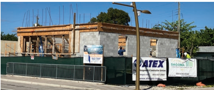
Commencement of construction of B&D Trap Restaurant