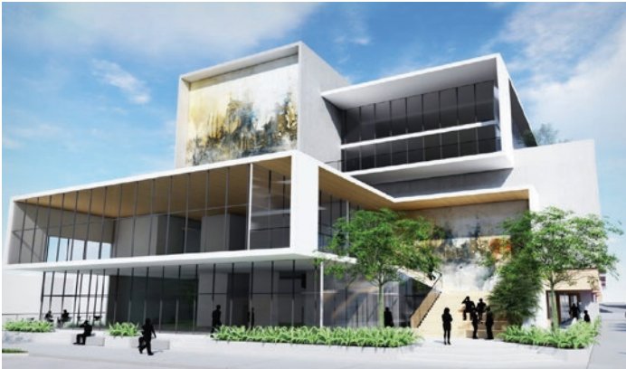
Rendering of a mixed-use commercial development project located at 909 Sistrunk Boulevard