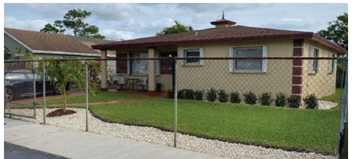
Completion of a home renovated through a pilot program with Rebuilding Together Broward County, Inc.