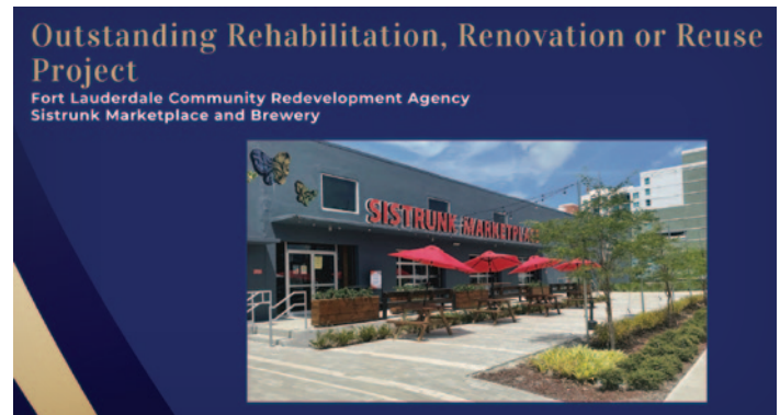
Sistrunk Marketplace and Brewery Award for Outstanding Rehabilitation, Renovation or Reuse Project

Founded in 1974, the Florida Redevelopment Association (FRA) is a not-for-profit organization dedicated to assisting Florida professionals and volunteers in community revitalization efforts. With a mission of "transforming spaces and revitalizing places", the organization has more than 300 members representing the over 220 Community Redevelopment Agencies throughout the State of Florida. Knowledge and common experiences are shared regarding revitalization opportunities and issues, identifying best practices, legal and financial tools, and programs favorable to community growth and serves as a statewide clearinghouse for redevelopment information. During the Association's annual banquet, the Fort Lauderdale Community Redevelopment Agency received the 2022 Roy F. Kenzie Award for Outstanding New Building for the L.A. Lee YMCA/Mizell Community Center and for Outstanding Rehabilitation/Renovation Project for the Sistrunk Marketplace and Brewery Project.