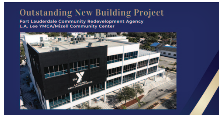
L.A. Lee YMCA/Mizell Community Center for Outstanding New Building Project