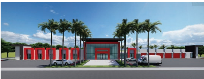
Rendering of Dales Wheels and Tires Direct, Inc. project