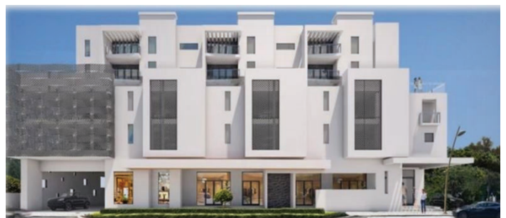
Rendering of Wright Dynasty, LLC mixed-use project