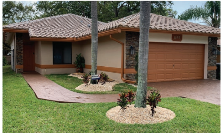
Completion of a home renovated through the CRA Residential Facade and Landscaping program