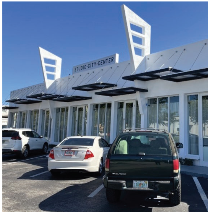
850 NE 13 Street - After Renovations