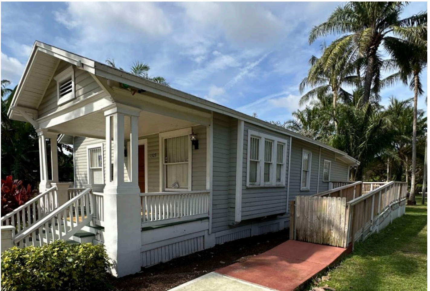
Image: Annie Beck House, February 2024