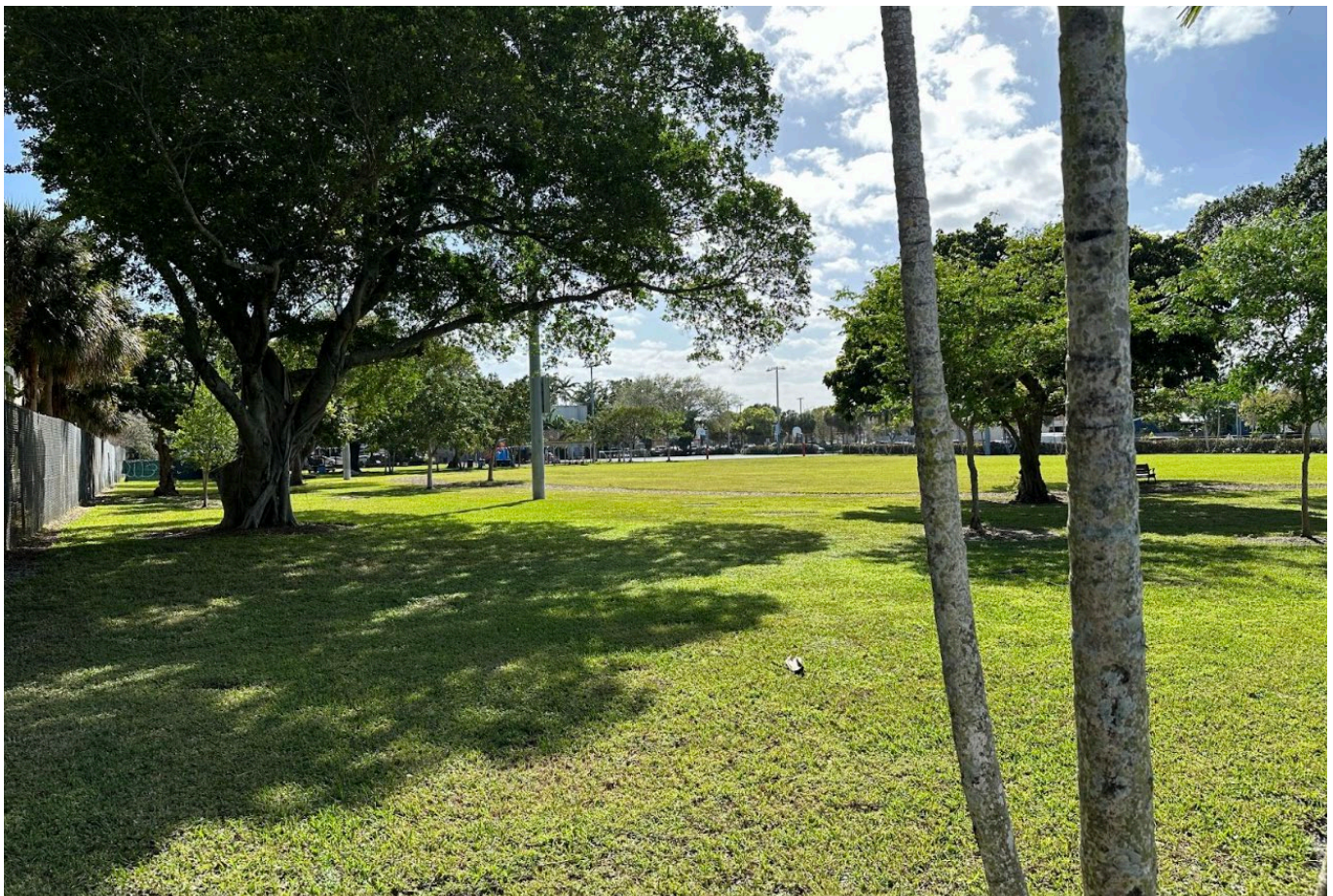
Image: Warfield Park, February 2024

In the following decades, Warfield Park emerged as a central node in urban life, providing various recreational and entertainment facilities. The park was not just a green space, it was a dynamic venue where people of all ages could engage in various clubs and activities, including Chess, Camera, and Dance clubs, shuffleboard games, etc.