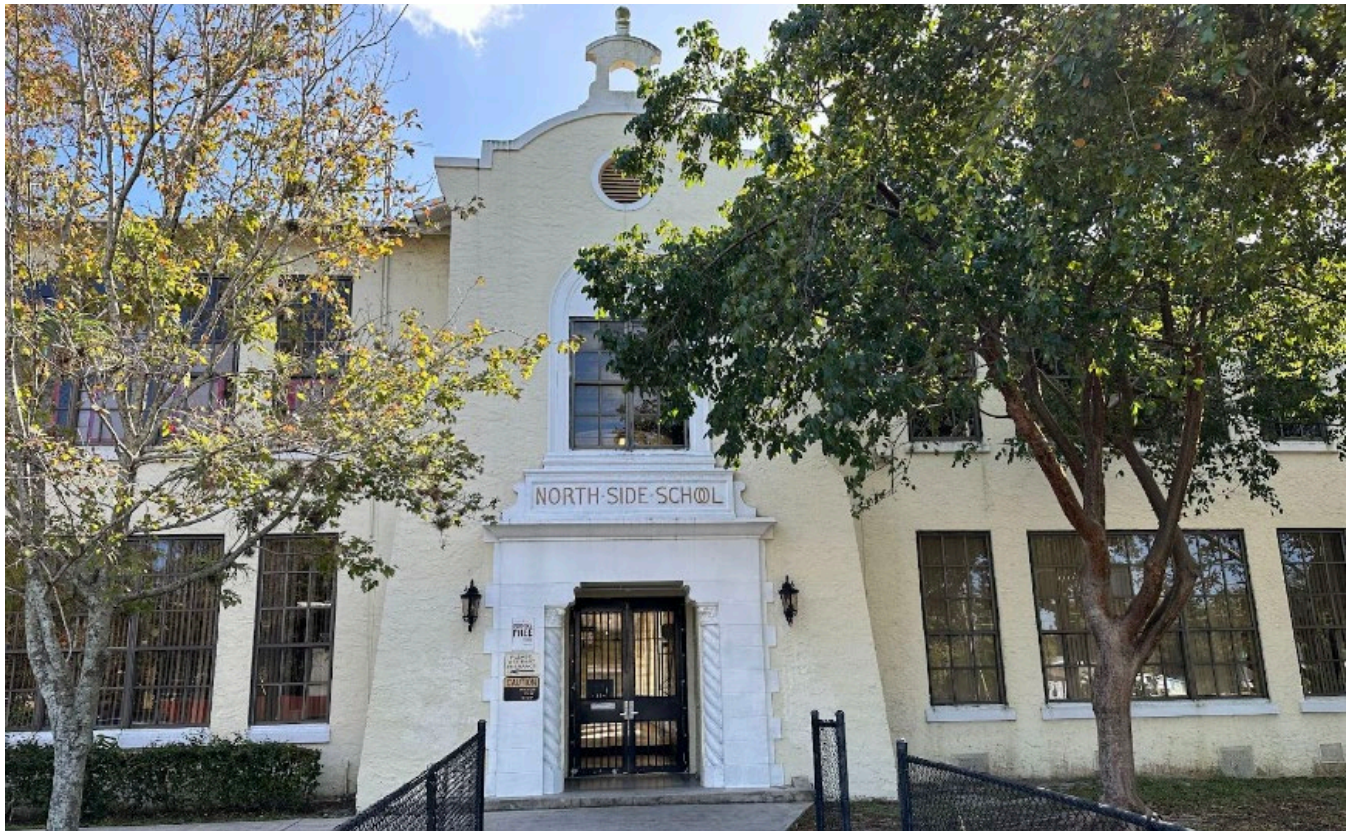
Image: North Side School, February 2024