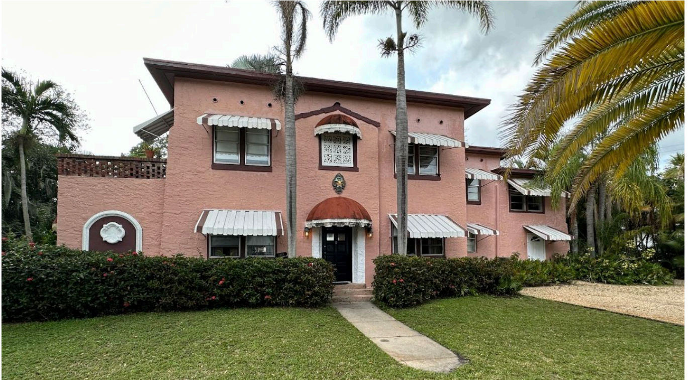
Image: 1625 NE 1st Avenue, February 2024

This historical trajectory illustrates the evolving functions and ownership of the property at 1625 NE 1st Avenue, reflecting broader economic and social changes in Fort Lauderdale throughout the mid-20th century. The property's various uses, from a private residence to a riding academy and day nursery, underscore the dynamic nature of real estate development in the region.