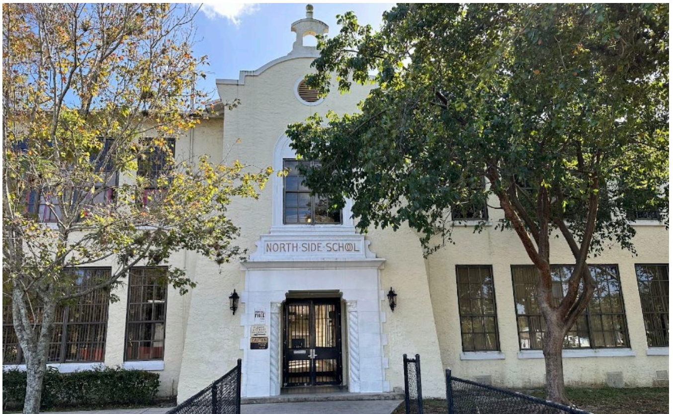
Image: North Side School, February 2024