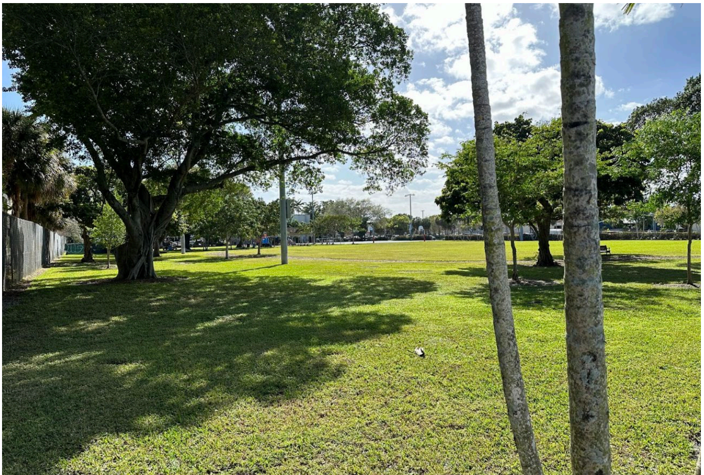
Image: Warfield Park, February 2024

In the following decades, Warfield Park emerged as a central node in urban life, providing various recreational and entertainment facilities. The park was not just a green space, it was a dynamic venue where people of all ages could engage in various clubs and activities, including Chess, Camera, and Dance clubs, shuffleboard games, etc.