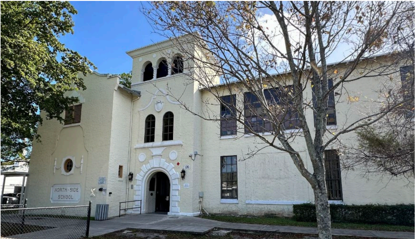
Image: North Side School, February 2024