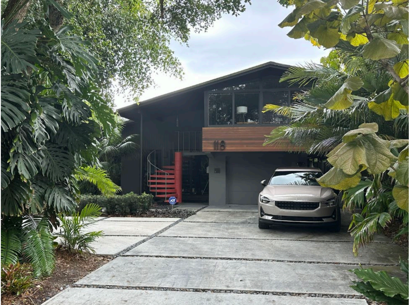
Image: 118 NE 16th Place, February 2024