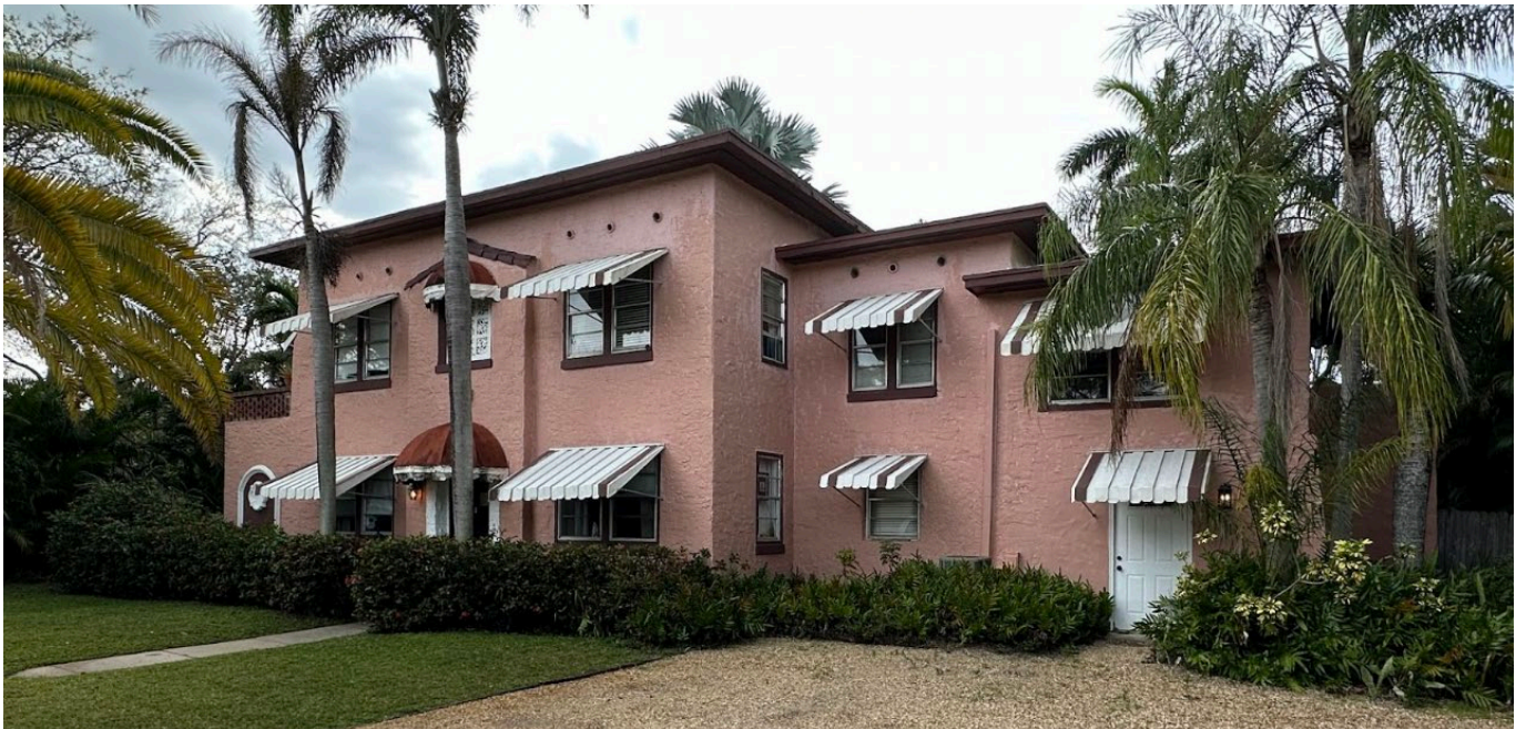
Image: 1625 NE 1st Avenue, February 2024