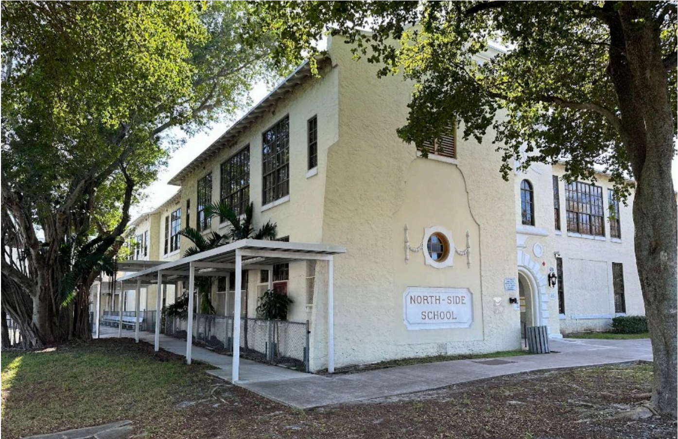
Image: North Side School, February 2024