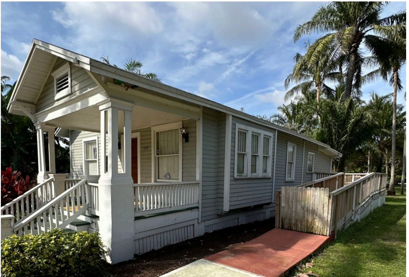
Image: Annie Beck House, February 2024