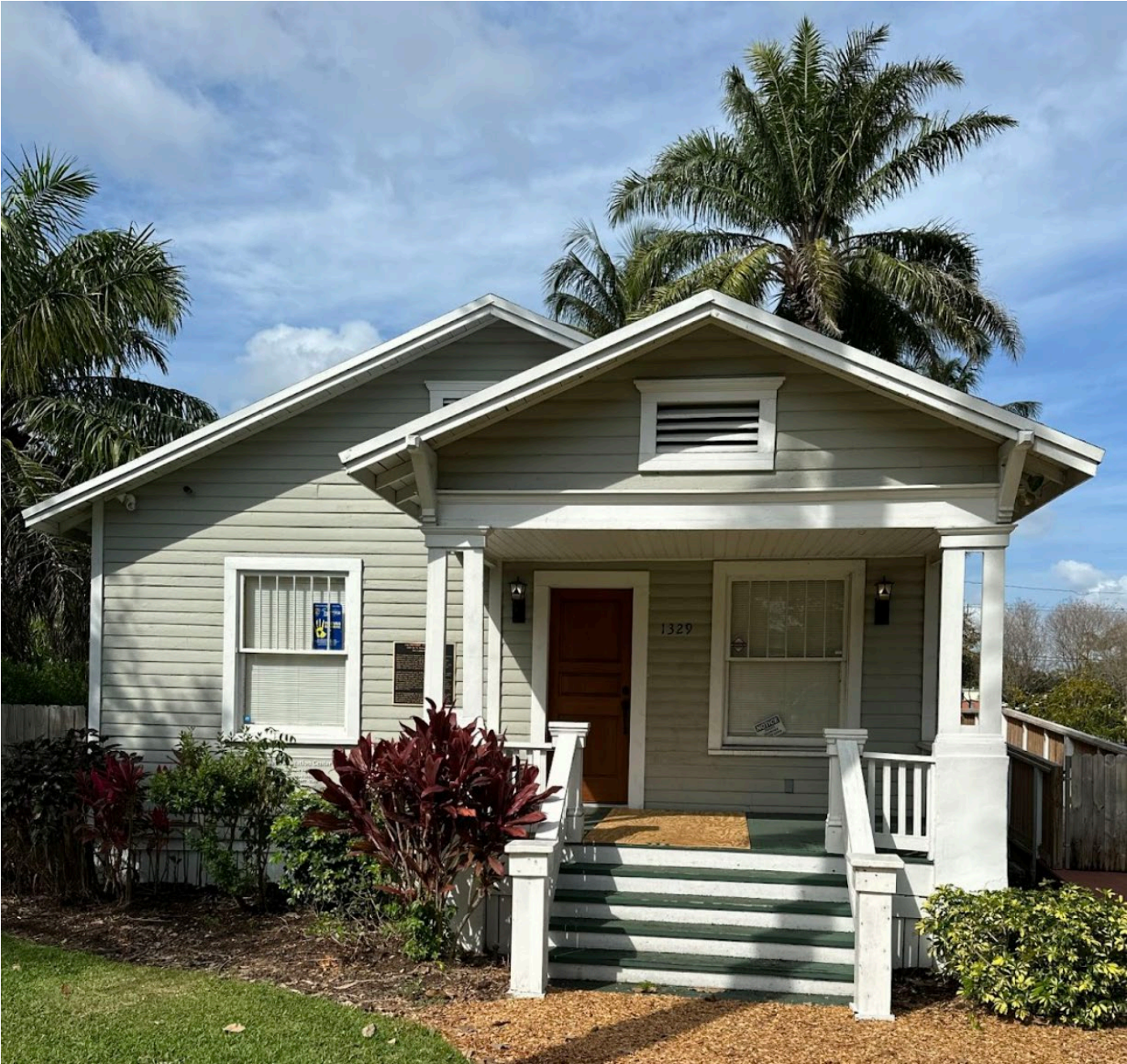
Image: Annie Beck House, February 2024