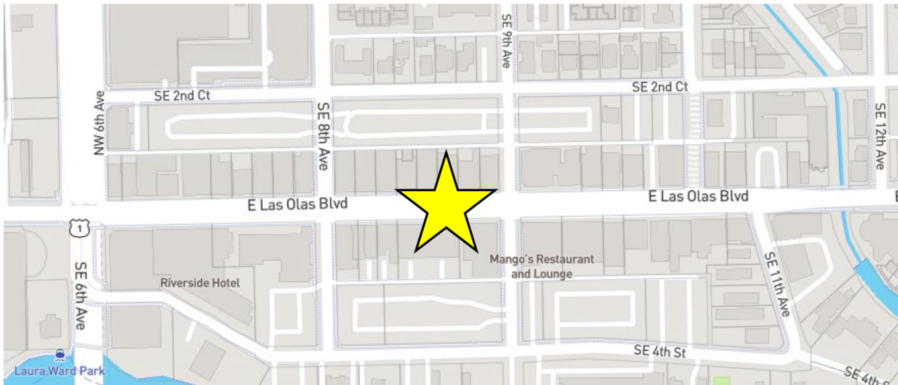
EXHIBIT C Christmas on Las Olas