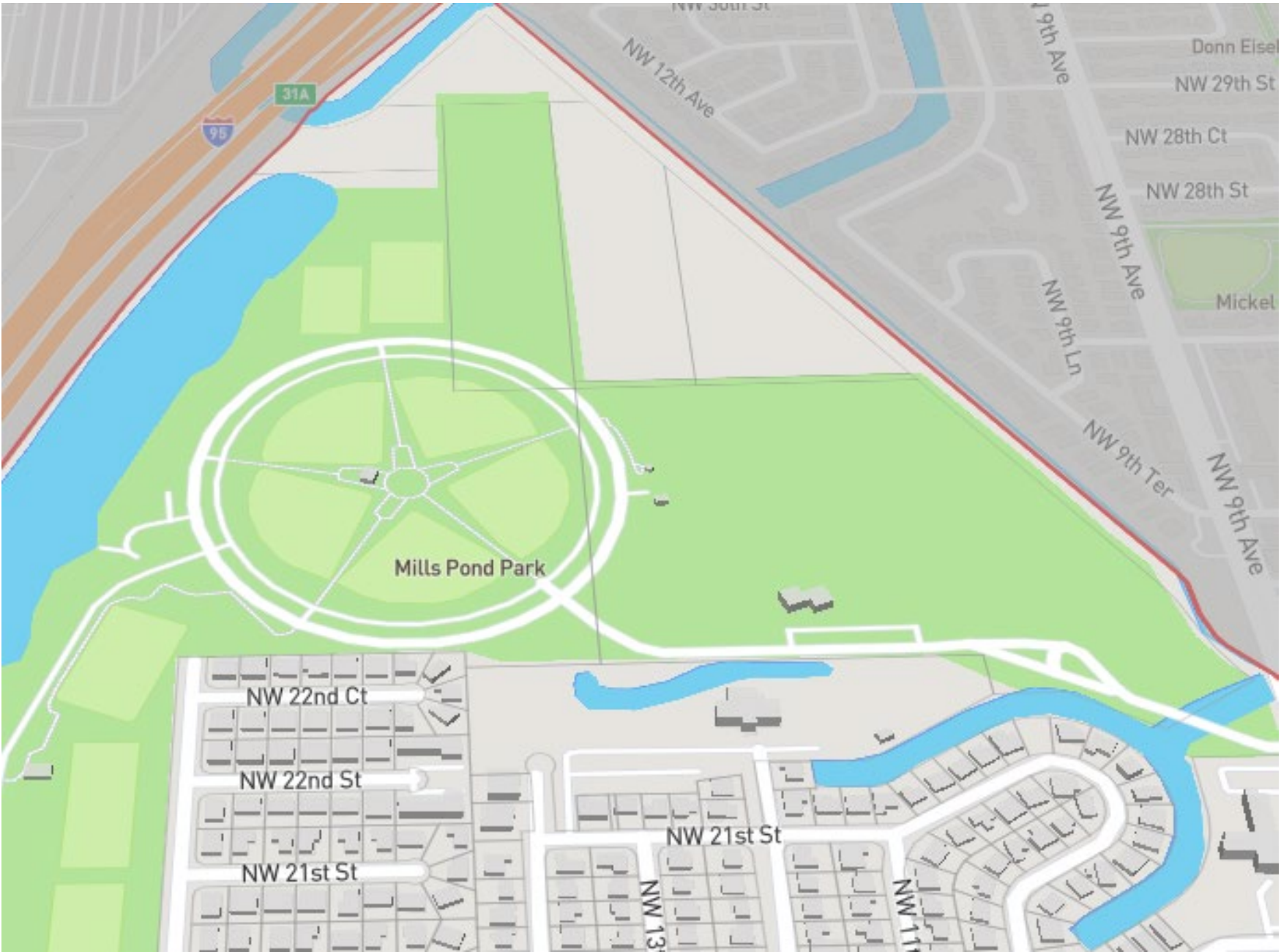
Exhibit C - Event Location Map