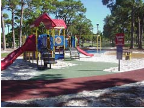
Parks Bond Back Up