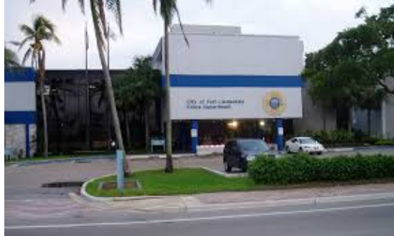
Police Bond Back Up