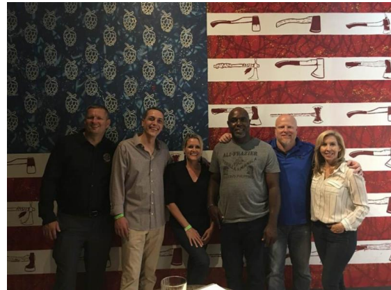
Great time celebrating our Fraternal Order of Police and Fort Lauderdale Professional Firefighters at Chops and Hops.