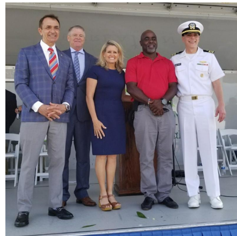
Memorial Day Service at Lauderdale Memorial Park Cemetery. We salute those who have served and sacrificed for our country.