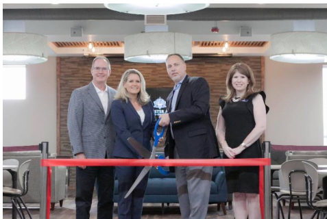
Congratulations Westminster Academy on the new Dr. Kenneth P Wackes Media Center.