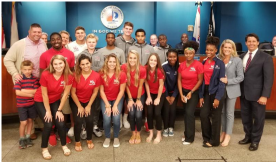
Congratulations to Westminster Academy, in District 1, State Champion Boys' Basketball Team and Cheerleaders!